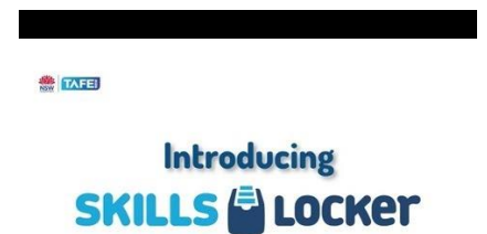
Video: Introduction to SkillsLocker